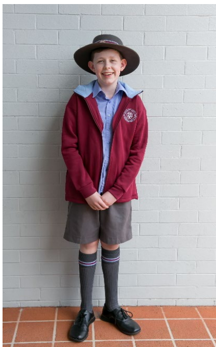
Junior Formal Uniform