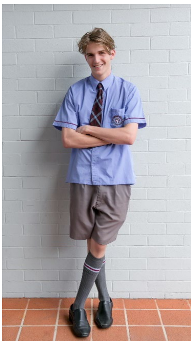
Senior Formal Uniform