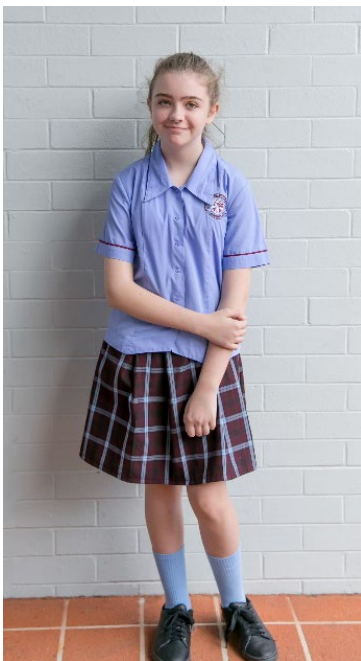
Junior Formal Uniform