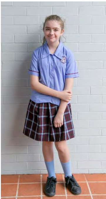
Junior Formal Uniform