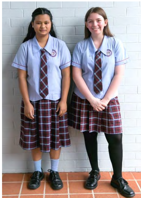
Senior Formal Uniform